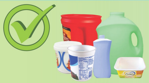
Rigid Molded Plastic Containers - No lids